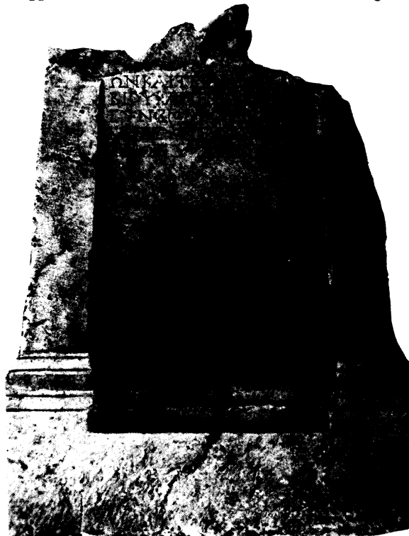
Figure 3. No. 11, Appia