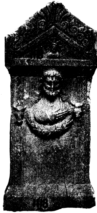
Figure 4. No. 9, Appia