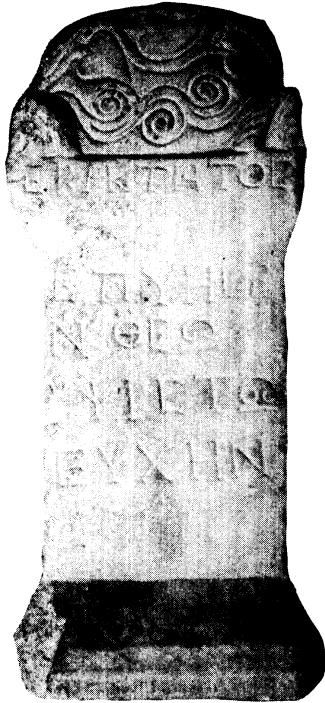
Figure 1. No. 1, Akmonia