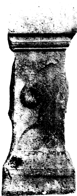
Figure 2. No. 14, Metropolis, front of altar