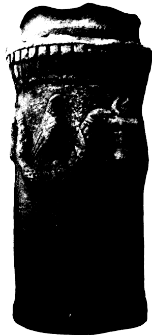
Figure 2. No. 12, Appia