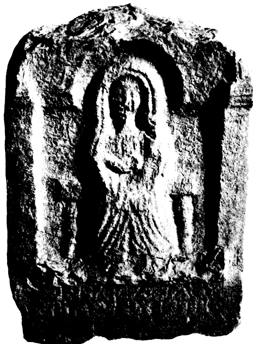
Figure 2. No. 18, provenience uncertain