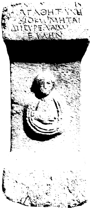
Figure 3. No. 8, Nakoleia or Kotiaeion