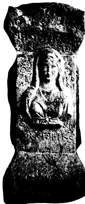
Figure 4. No. 20, provenience uncertain