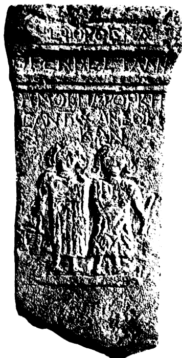
Figure 1. No. 17, provenience uncertain