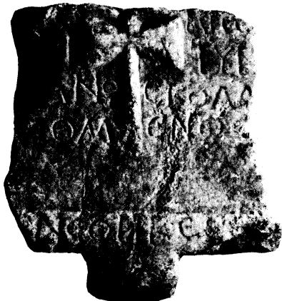
Figure 4. No. 15, Eumeneia