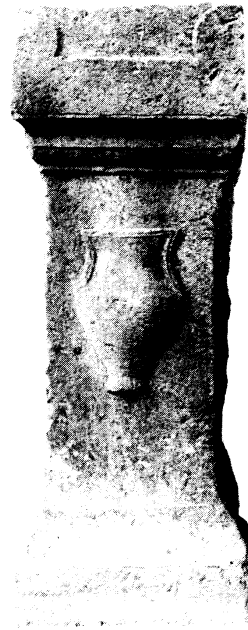
Figure 3. No. 14, right side of altar