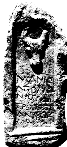
Figure 5. No. 16, Dionysoupolis?