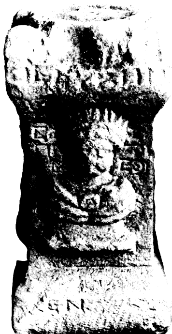
Figure 3. No. 19, provenience uncertain