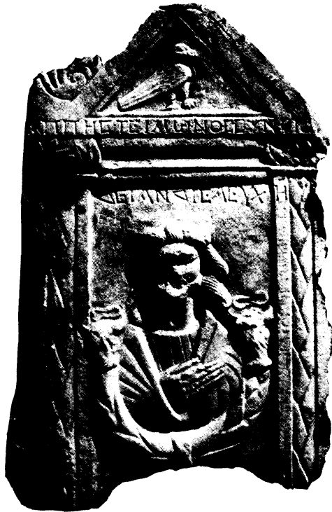
Figure 1. No. 10, Appia