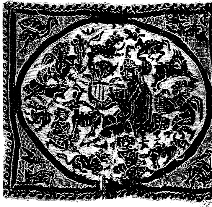
(b) Egyptian Textile, Victoria and Albert Museum, London (1190/P 1054)