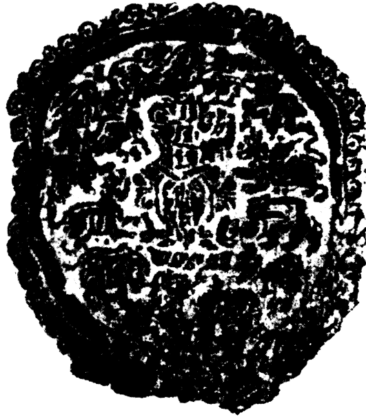
(a) Egyptian Textile, Moscow (private collection)