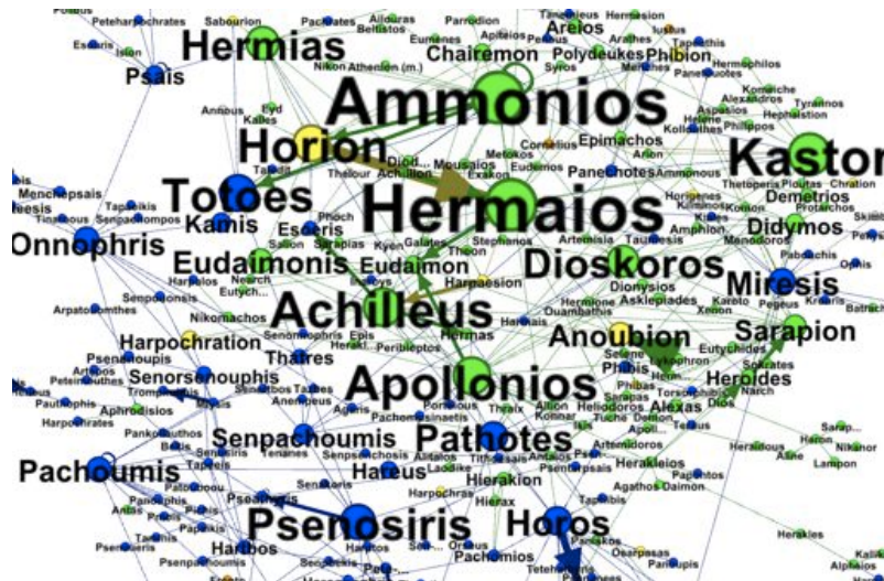
Figure 3: Central part of the Hermopolite network (nodes are sized according to betweenness centrality)

Names with high betweenness centrality form bridges between the two components of the network. Betweenness centrality does not measure how many direct links a node has, but rather how often other nodes have to go through it to reach each other. 27 Names like Hermaios and Ammonios, with a high degree centrality, obviously also score high when it comes to betweenness, since they are linked to many names ( fig. 3 ). But as they are embedded in the Greek component only, it is more interesting to look for those with high betweenness connecting the two components. Totoes, Horion, Horos, Apollonios, and Dioskoros all refer to popular (Graeco-) Egyptian gods (i.e. Tutu, Horos/Apollo, and the twins Kastor and Pollyx respectively); their intermediate position is therefore unsurprising. The same applies to Hermias and Pathotes, as they refer to