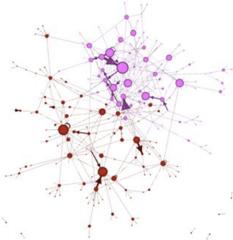
Figure 2: Community detection in the giant component: Egyptian (red) vs Greek (purple)

The average degree (i.e. the average number of links that a name has) 20 of the Greek component is slightly higher than that of the Egyptian one (1.66 vs 1.33 respectively), a first clue for more cohesion in this part of the network. In other words, people with Greek names chose from a more limited onomastic set. However, the average degree does not take into account the direction of the links. The direction is important here, however, for it is an indication of the popularity and common-