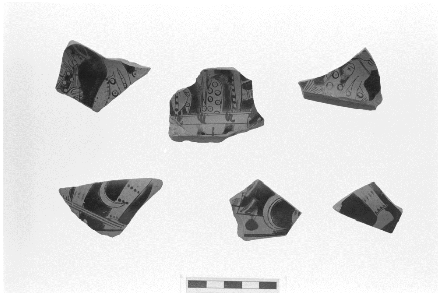
Figure 2: Attic red-figure hydria fragments, Corinth, Archaeological Museum T620 + T1144.

dots or lozenges. The choreuts on the Basel krater strike a similar balance between uniformity and individuality. They all wear the same type of top but these are decorated differently, with various combinations of palmette symbols and a maeander, which is the flipped L-shape pattern. The top worn by the leftmost choreut bears the unique detail of an image of a running man or satyr.