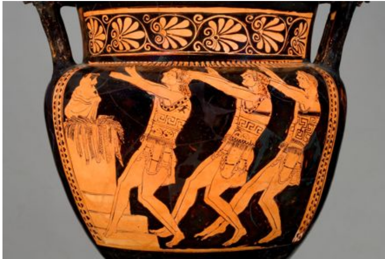
Figure 1: Attic red-figure column krater, Basel, Antikenmuseum und Sammlung Ludwig BS 415.

chorus, as several details make clear. There are letters inscribed next to their open mouths, a likely indication that they are singing. 3 They also seem to be dancing, processing from right to left across the vase while leaning backwards slightly at the waist, extending their right legs forward, left legs backward, and stretching their arms in front of themselves. They wear nearly identical attire: diadems on their heads, sleeveless tops,