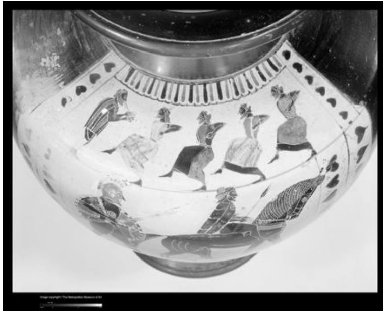
Figure 5: Attic black-figure hydria, New York, Metropolitan Museum of Art 1988.11.3.

acters at the expense of the performers. This is the case for the Corinth hydria, which does not advertise how its Persians would be embodied and enacted by performers. On this vase, it is difficult to distinguish between what details belong to the actual performance and what may belong to the invention of the painter.