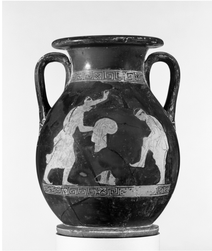
Figure 3: Attic red-figure pelike, Boston, Museum of Fine Arts 98.883.

The second type of vase-painting connected to tragedy depicts performers, often choreuts, either preparing for performance or relaxing in its aftermath. Called ‘genre-scenes’ by some, 36 these paintings, although they turn their attention away from performance per se , still reveal much about tragedy with their focus on the peripheral events of performance. A red-