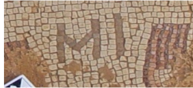
Fig. 9: Mishael (ΜΙ)

The faces and bodies have been completely destroyed, except for parts of their hats and half of the face of Azaria, which survives with the entirety of his hat. Under the four brothers, a kind of symbolic fire is very clear. The four names are written in Greek letters over the heads of the four brothers. The name of Michael was destroyed by iconoclasm: only two letters survive, ΜΙ, and the remains of Michael's hand.