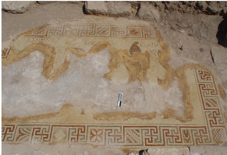
Fig. 5: Daniel and his brothers

Rasas (587/8). 21 Two other examples of pomegranate trees are at Umm al-Rasas, one in the Church of the Lions (late sixth century) 22 and one in the Church of St. Stephen (756). 23