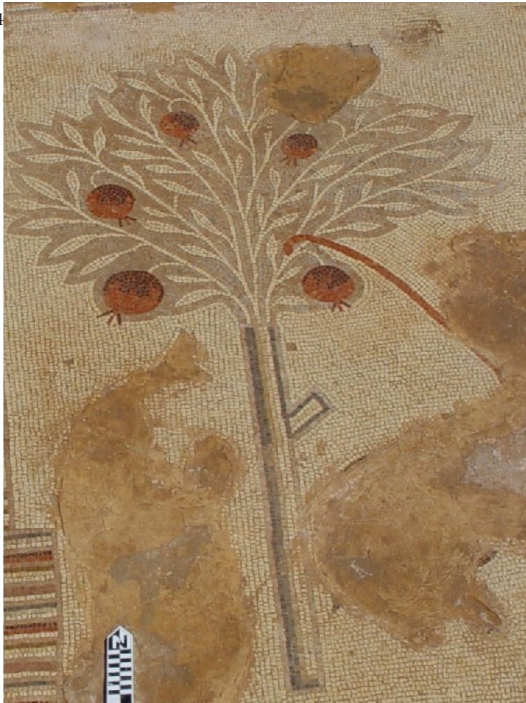
Fig. 4: North aisle mosaic, the pomegranate tree

Acropolis at Ma'in (dated 719/20) is decorated with pomegranate trees, 20 as is the church of Bishop Sergius at Umm al-