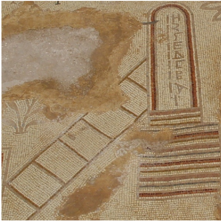
Fig. 3: North aisle mosaic, the Nilometer

A Nilometer using the same numerical system is found elsewhere in the same era, at the 'House of Leontis' in Beit Shean (Beisan), which may have functioned as a synagogue (fifth-sixth centuries); there, however, we find fewer numbers on the Nilometer than at the Ya'amun church (IA–IZ = 11–17). 14 A Nilometer is portrayed on the floor of the et-Tabgh church (second half of the fifth century). 15 Another example