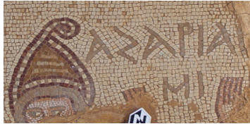
Fig. 8: Azariah (ΑΖΑΡΙΑ)