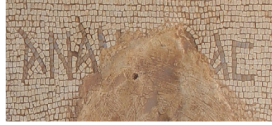
Fig. 7: Hananiah (ΑΝΑΝΙΑΣ)