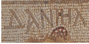
Fig. 6: Daniel (ΔΑΝΙΗΛ)