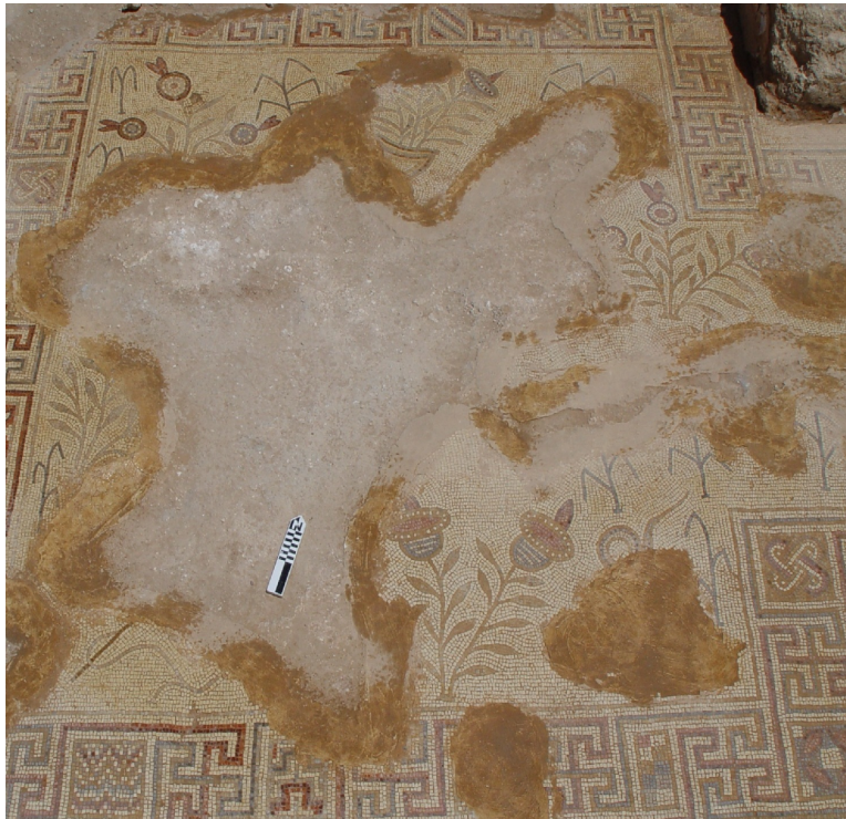
Fig. 2: North aisle mosaic, the Delta