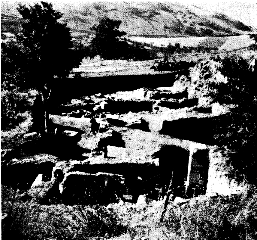
SOUTHERN DEMETER SANCTUARY AT MORGANTINA. HOUSE OF THE PRIEST, LOOKING SOUTHEAST