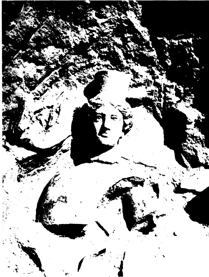
TERRACOTTA BUST OF DEMETER, AS FOUND ON FLOOR OF ROOM 5