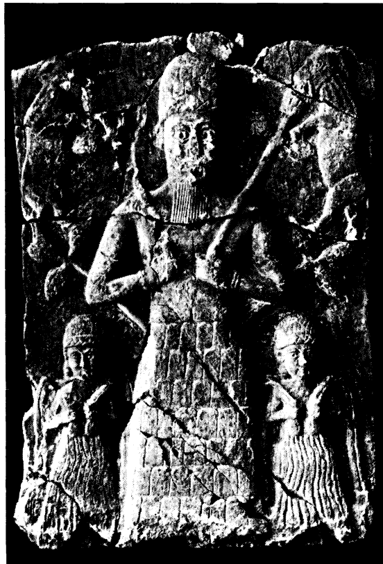
Figure 4. Relief from Assur, early Second Millennium B.C.

DIONYSIAC PROCESSION WITH FLUTE-PLAYER AND GOAT (cf. n.25 no.14)