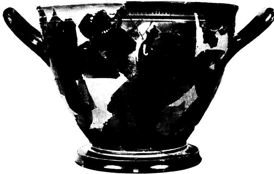
Figure 1. Skyphos of the Theseus Painter, Agora P 1544