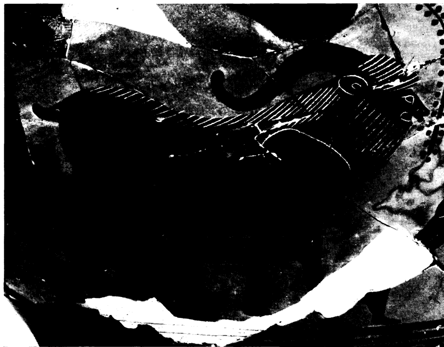
Figure 2. Detail of Skyphos, Agora P 1544

DIONYSIAC PROCESSION WITH FLUTE-PLAYER, WINE-AMPHORA, GOAT (cf. n.25 no.13)