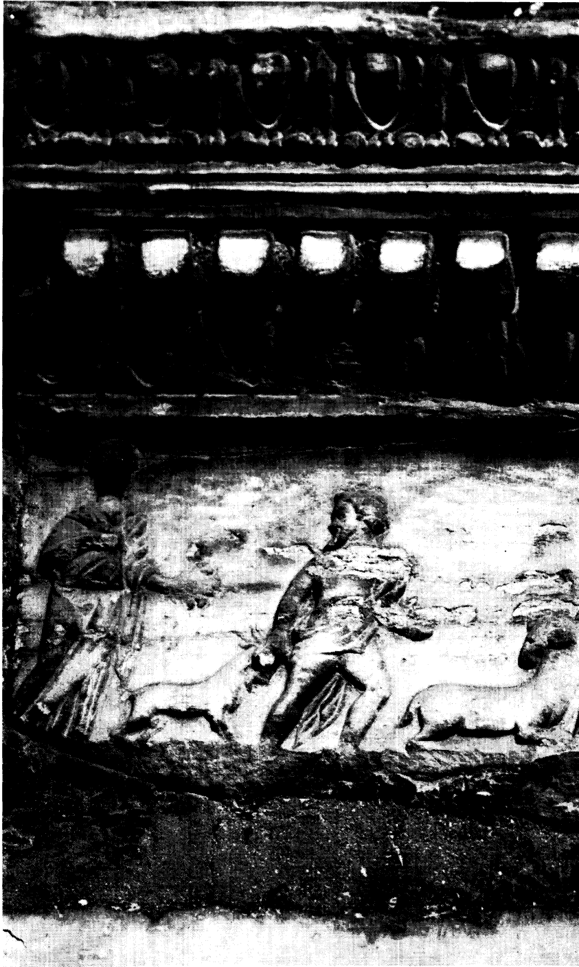
THE GREAT DIONYSIA: POMPE (OR THEORIA), ACTOR WITH GOAT, ZODIACAL SIGN OF ARIES, from CALENDAR FRIEZE, ATHENS (cf. n.24)