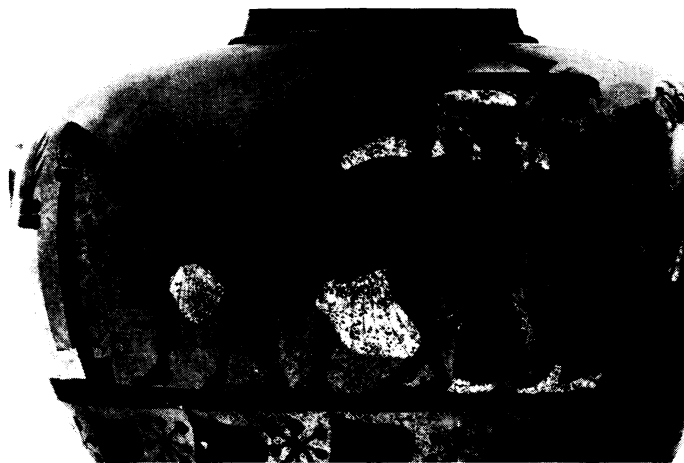
Figure 5. Detail of Caeretan Hydria, Copenhagen 13567