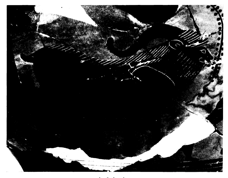
Figure 2. Detail of Skyphos, Agora P 1544 DIONYSIAC PROCESSION WITH FLUTE-PLAYER, WINE-AMPHORA, GOAT (cf. n.25 no.13)