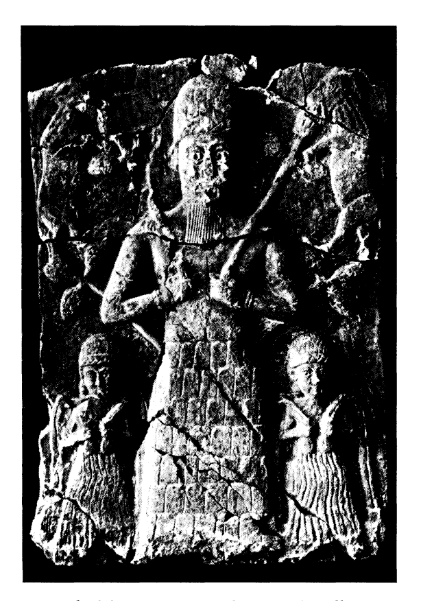
Figure 4. Relief from Assur, early Second Millennium B.C. (W. Andrae, Kultrelief aus dem Brunnen des Assurtempels zu Assur [Berlin 1931] plate 1)