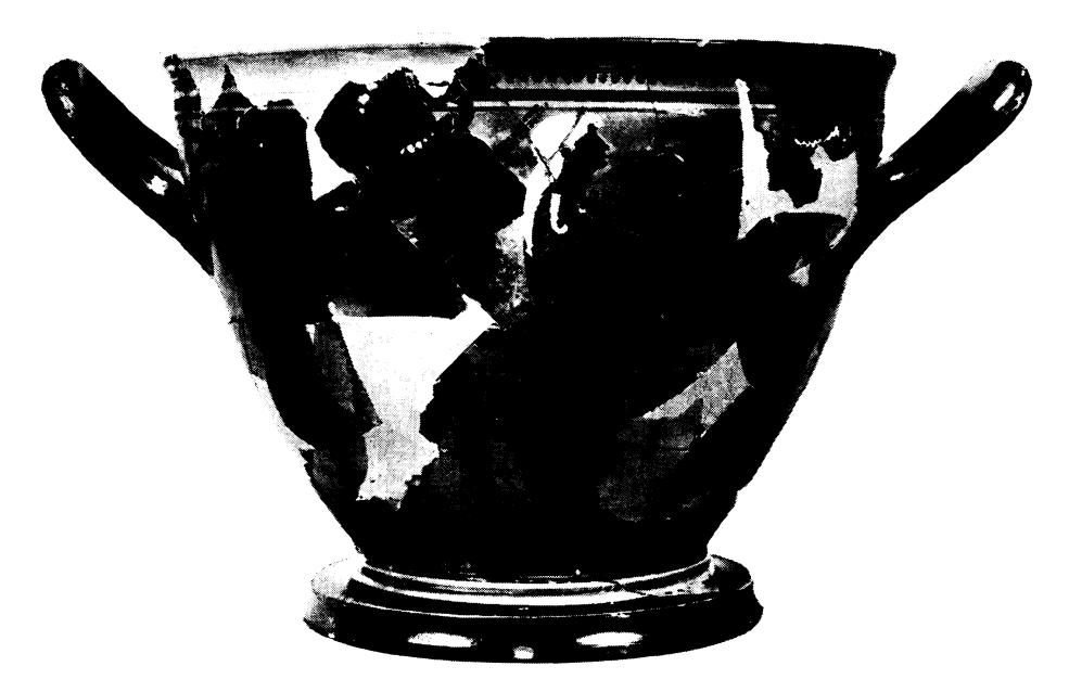
Figure 1. Skyphos of the Theseus Painter, Agora P 1544