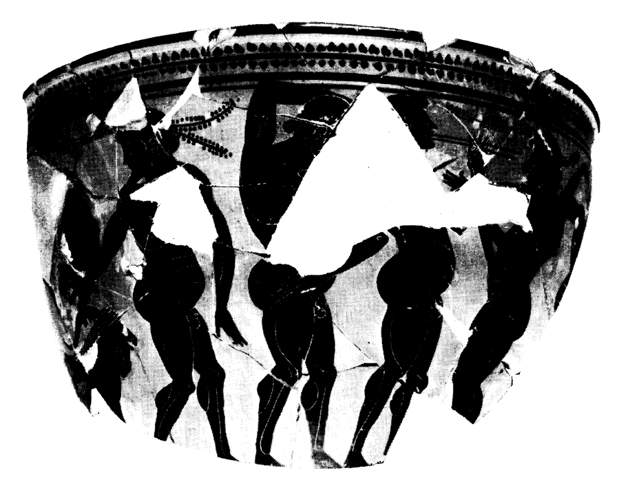
Figure 3. Skyphos of the Theseus Painter, Agora P 1547 DIONYSIAC PROCESSION WITH FLUTE-PLAYER AND GOAT (cf. n.25 no.14)