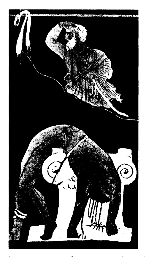
Figure 6. Detail of Campanian Amphora Paris, Cabinet des Médailles 876 (A. de Ridder, Catalogue des vases peints de la Bibliothèque Nationale [Paris 1902] figure 126) MEDEA'S SON DYING AT AN ALTAR