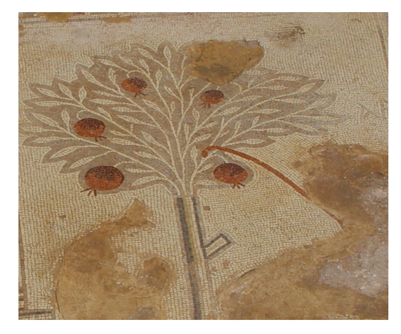
Figure 2. Pomegranate tree

Pomegranate tree decorations became widespread in Jordan during the Byzantine period. One example is in the north aisle of the church of Saint John at Gerasa (A.D. 531).<sup>6</sup> There the pomegranate tree stands in an architectural scene, while in the Ya'amun Church it is in the midst of a landscape. At Gerasa the colors are more realistic than at Ya'amun. An example in central Jordan similar to the Ya'amun church is the in the chapel of Suwayfiyah at Amman (sixth century).<sup>7</sup>