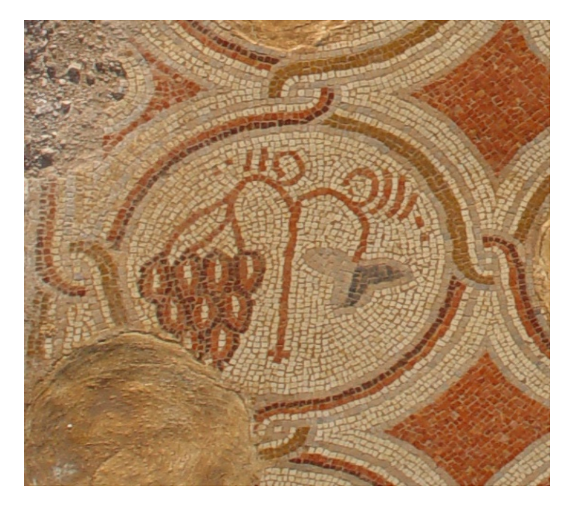
Figure 4. Grape cluster in looped motif

Fruits. In addition to the pomegranate trees and grapevines, isolated fruits are used: clusters of grapes, pomegranates, gourds, and wheat.