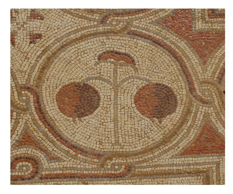
Figure 6. Pomegranates within a looped motif

There are two examples at Umm al-Rasas that are similar to those at Ya'amun. In the south aisle of the church of Saint Stephen (eighth century) the pomegranates are framed by interlaced squares, circles, and ellipses.<sup>55</sup> In the chancel of the church of the Lions (late sixth century) three pomegranates are within a circle.<sup>56</sup> Finally, the pattern is also known in the northern part of the Levant in the Mosaic of the Striding Lion at Antioch (fifth century; see n.51 above).