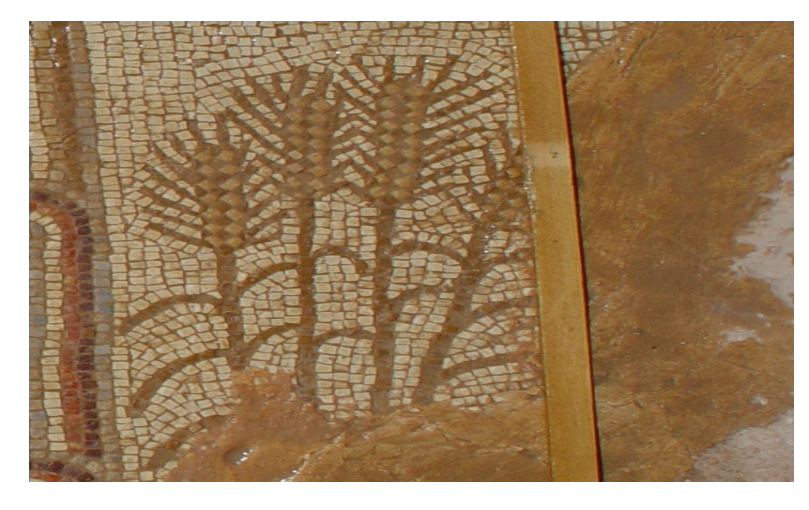
Figure 8. Spikes of wheat