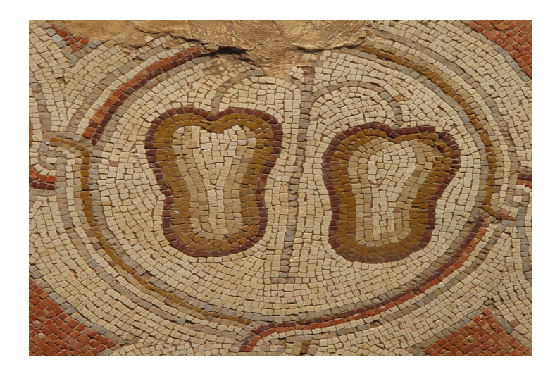
Figure 7. Gourds

gourds is confined to this church, and being unique it testifies to a creative artist at Ya'amun.