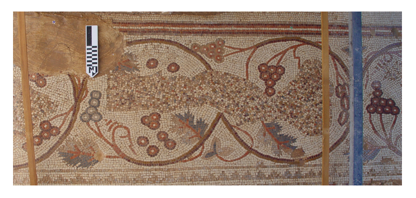
Figure 3. Scrolls of grapevines

Grapevines decorated the floors of many churches in Jordan, and especially in scroll form, and also within geometric motifs, both of which we find at Ya'amun. The vine and its fruit were of general interest in the Bible and often mentioned.<sup>26</sup> They had been represented earlier in the Roman period: an example is the floor of the Caseggiato of Bacchus and Ariadne at Ostia (ca. 120–130), in black and white.<sup>27</sup> The vine decor can be classified in order to study the scrolls and the fruit within the geometric patterns.